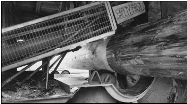
Figure 15-3. Machine peeling of poles. The outer bark has been removed by hand, and the inner bark is being peeled by machine. Frequently, all the bark is removed by machine.