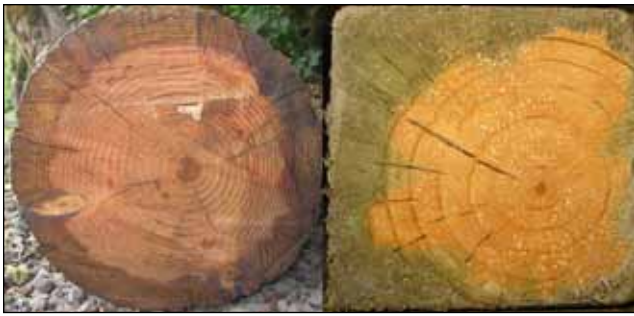
Figure 15–2. During pressure treatment, preservative typically penetrates only the sapwood. Round members have a uniform treated sapwood shell, but sawn members may have less penetration on one or more faces.

Similar comparisons have been conducted for preservative treatments of small wood panels in marine exposure (Key West, Florida). These preservatives and treatments include creosotes with and without supplements, waterborne preservatives, waterborne preservative and creosote dual treatments, chemical modifications of wood, and various chemically modified polymers. In this study, untreated panels were badly damaged by marine borers after 6 to 18 months of exposure, whereas some treated panels have remained free of attack after 19 years in the sea.