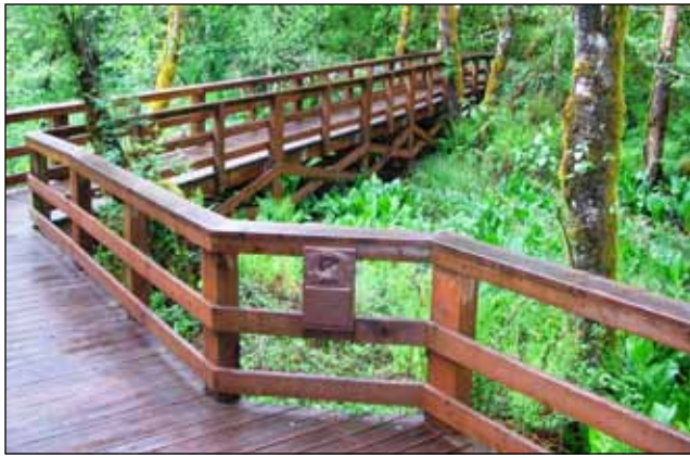
Figure 15–7. Wood preservative leaching, environmental mobility, and effects on aquatic insects were evaluated at this wetland boardwalk in western Oregon.

As with many materials, reuse of treated wood may be a viable alternative to disposal. In many situations treated wood removed from its original application retains sufficient durability and structural integrity to be reused in a similar application. Generally, regulatory agencies also recognize that treated wood can be reused in a manner that is consistent with its original intended end use.