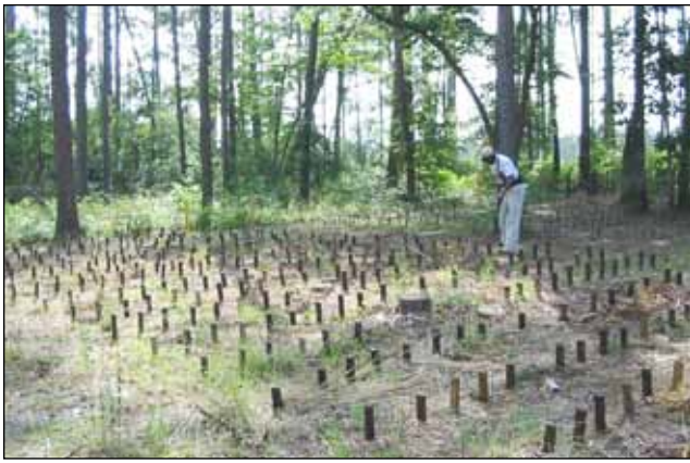
Figure 15–1. Field stake test plot at Harrison Experimental Forest in southern Mississippi.

preservatives may also be used at lower retentions to protect wood exposed in lower deterioration hazards, such as above the ground. The exposure is less severe for wood that is partially protected from the weather, and preservatives that lack the permanence or toxicity to withstand continued exposure to precipitation may be effective in those applications. Other formulations may be so readily leachable that they can be used only indoors.