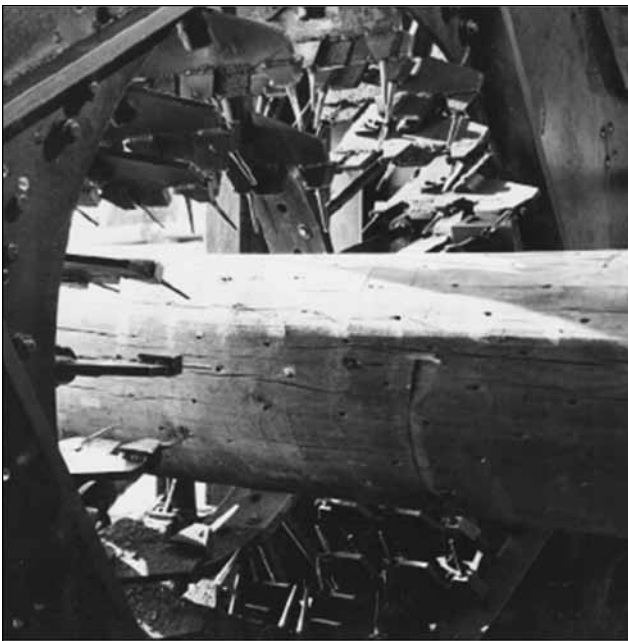
Figure 15-4. Deep incising permits better penetration of preservative.

seasoning yard, methods of piling, season of the year, timber size, and species. The most satisfactory seasoning practice for any specific case will depend on the individual drying conditions and the preservative treatment to be used. Therefore, treating specifications are not always specific as to moisture content requirements.